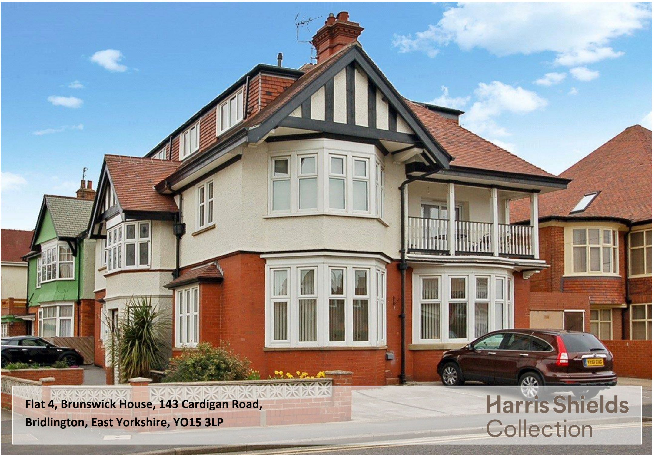
Flat 4, Brunswick House, 143 Cardigan Road, Bridlington, East Yorkshire, YO15 3LP